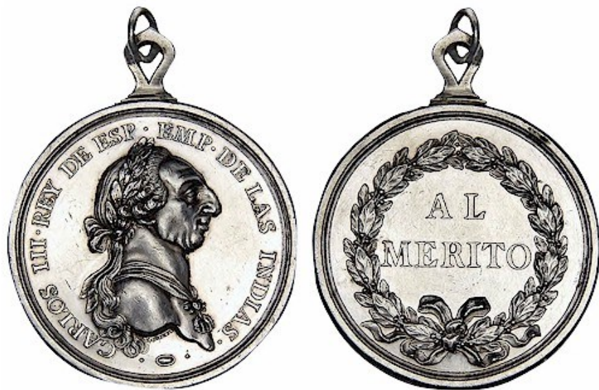
Large Specimen #2, Fig. 5 This medal is from the John W. Adams Collection