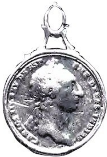
Small Specimen #1, Fig. 2 This medal presented to the Quapaw Chief (Ki-He-Kah)

On April 8, 1775 at the request of Luis de Unzaga, the Governor of Louisiana, 4 Gold and 2 silver medals were sent to the Department of Marine, and the Indies. Unzaga the Governor of Louisiana had also distributed small medals left to him by the previous Governor of Louisiana, Alejandro O'Reilly. In July 1777, 2 more gold medals were sent to Chile. In July 1778, under the governor of Spanish Illinois, Frnando de Leyba, 2 small medals were given to Osage Chiefs, and another 4 to 6 more medals were requested. 12