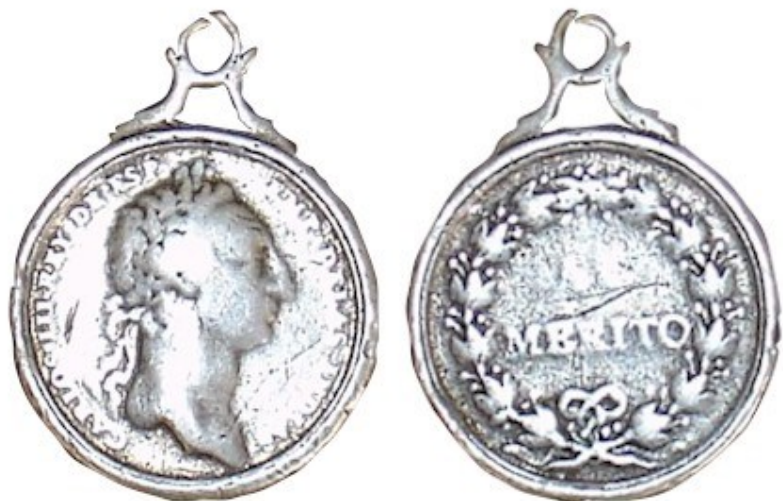
Small Specimen #2, Fig. 3 Steve Cox Collection